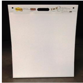
44. Dry Erase Table Top Pad