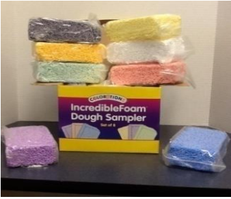
26. Foam dough