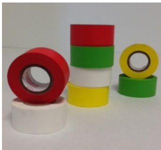
9. Removable Poster Tape