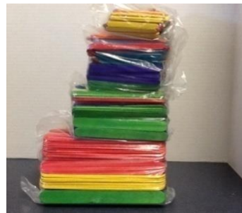
24. Colored craft sticks