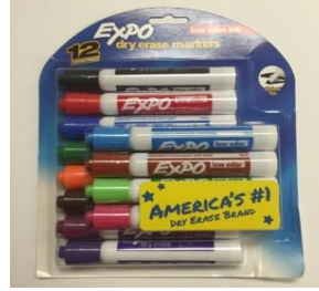
41. Dry Erase Markers