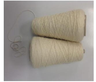
29. Natural Cotton Wrap Yarn