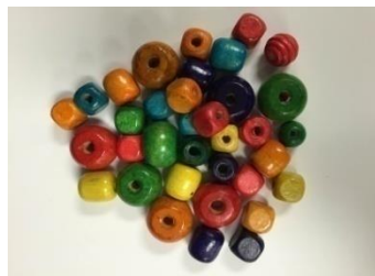
22. Wooden beads