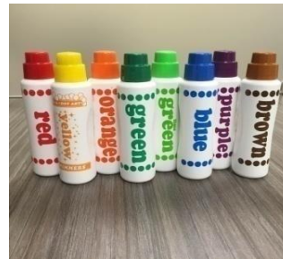
5. Dot Art Markers Available at Central Library Only