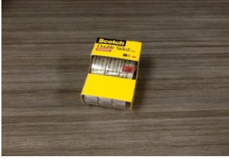
13. Double-Sided Tape