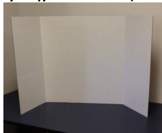
36. Tri-Fold Display Board