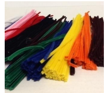
25. Pipe cleaners