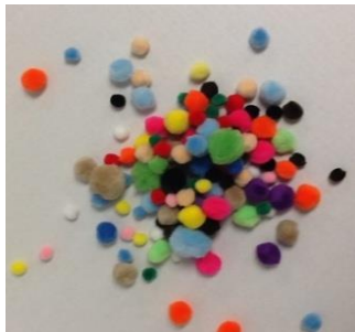
19. Pom Poms