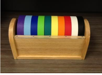
39. 1" Colored Masking Tape & Dispenser

The following items must stay inside the library ( May only request 1 total)