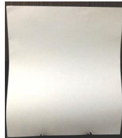
37. White Poster Board