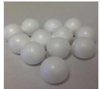
21. Styrofoam balls