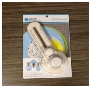
7. Large Circle Cutter