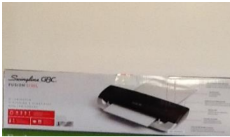
47. Laminator - Fusion 3100L 12" Available at Central Library Only