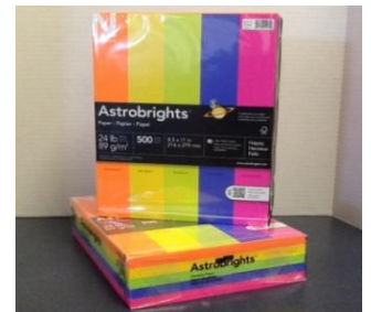
34. Bright Color Paper, 8 1/2" x 11"