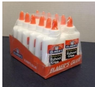
10. Washable School Glue