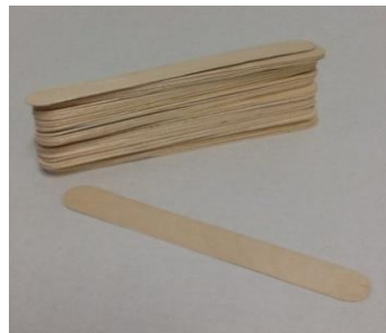
23. Natural craft sticks