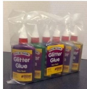
11. Glitter Glue