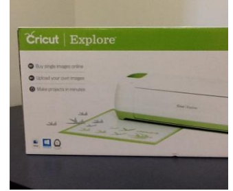
46. Cricut Explore (Paper cutting machine) Available at Central Library