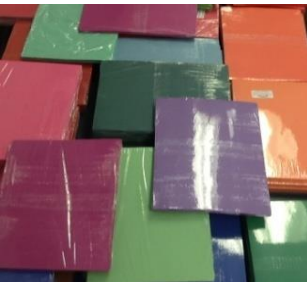
31. Construction Paper 9"x12"