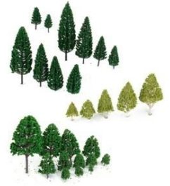
17. Mini trees