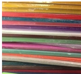
32. Large Construction Paper, 12"x 18" Available at Central Library Only