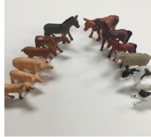
16. Farm animal figurines - Limit 1 per student