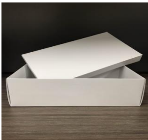
30. Shoe box (white) - Limit 1 per student