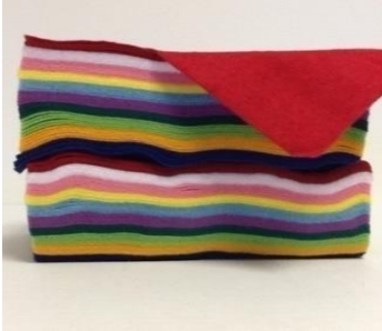
14. Felt Sheets