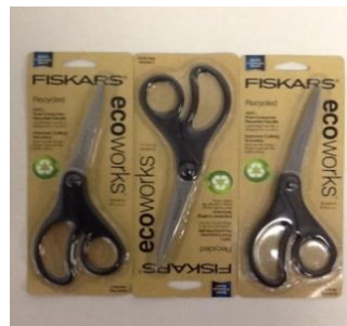
8. 8" Teacher Scissors