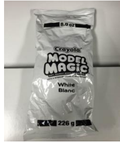
27. Modeling Clay - Crayola® Model Magic 1 oz (White) Limit 5 per student