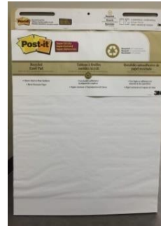
45. Easel Pad