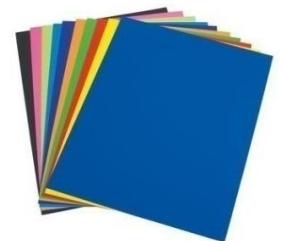
38. Colored Poster Board