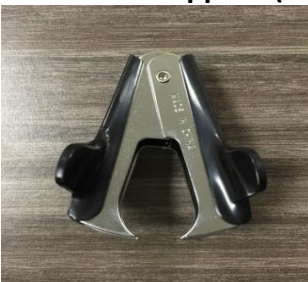
35. Staple Remover