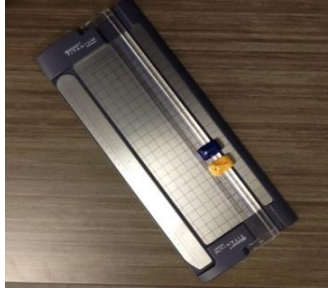
43. Paper Trimmer