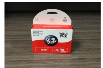
12. Glue Dots