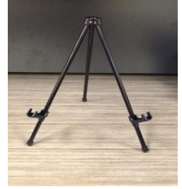
42. Tabletop Easel