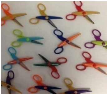
6. Krazy Kut Scissors