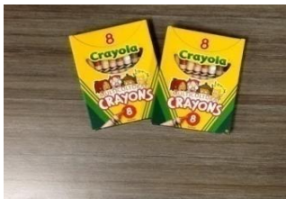
3. Multicultural Standard Crayons