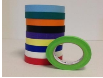
40. 1/2" Colored Masking Tape