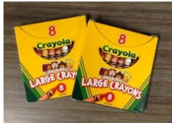
4. Multicultural Large Crayons